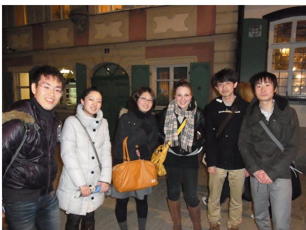
3 . The photograph taken with PhD student of UEN.