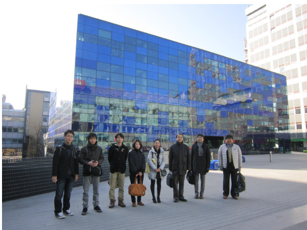
1 . The building of ICL