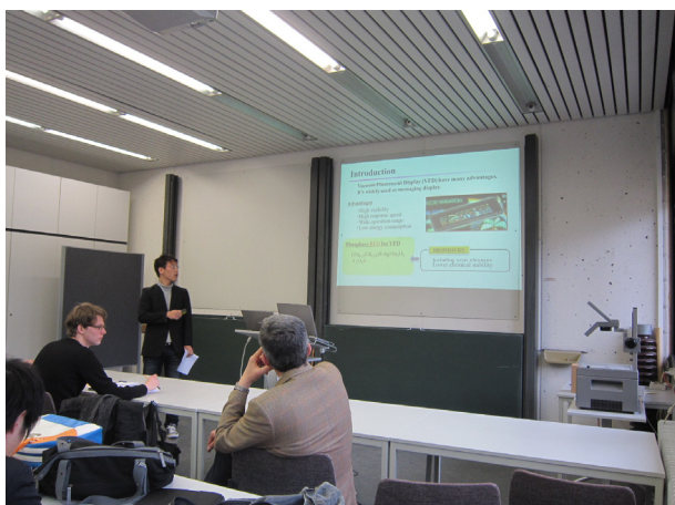
1. My presentation in English