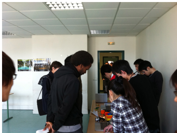
We introduce our university NITECH to EFREI's student in International Fair.