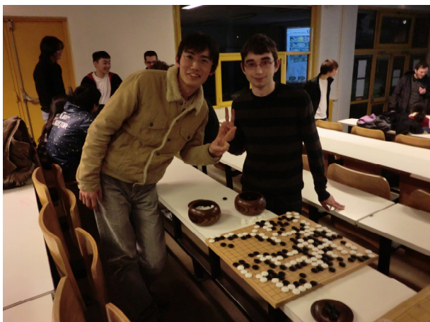
I joined AsianEFREI's event and I played go with French student.