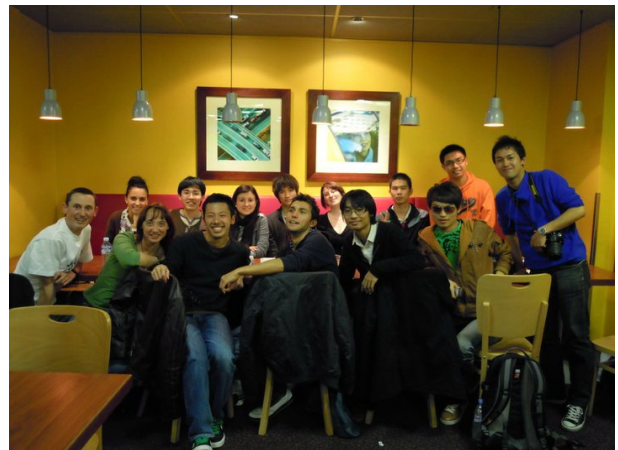
Party with foreign students